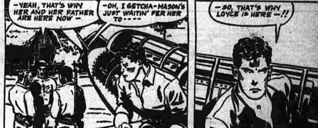
Freckles and His Friends