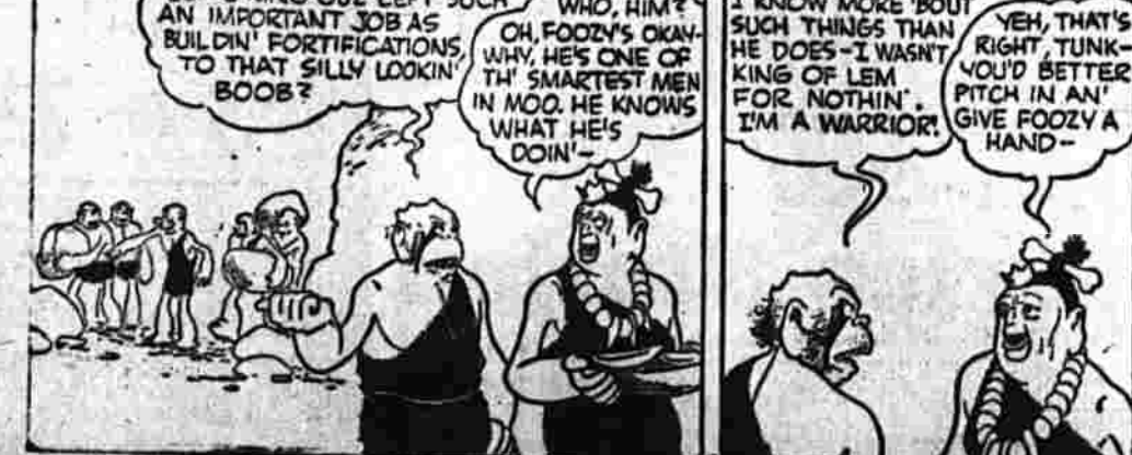
Tank Horns in