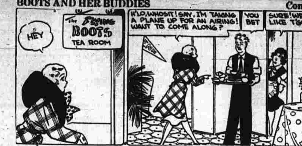
Boots and Her Buddies