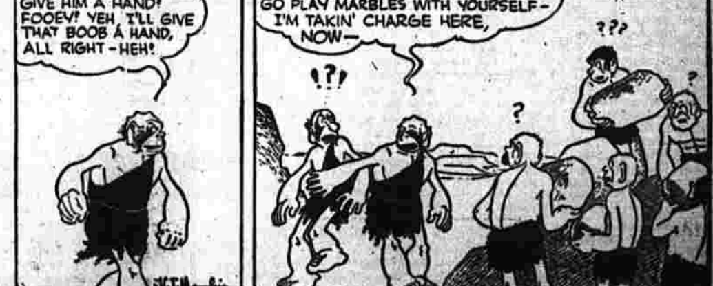
The Side Kick