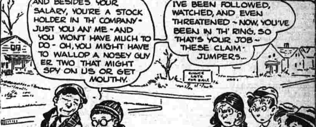
Out Our Way