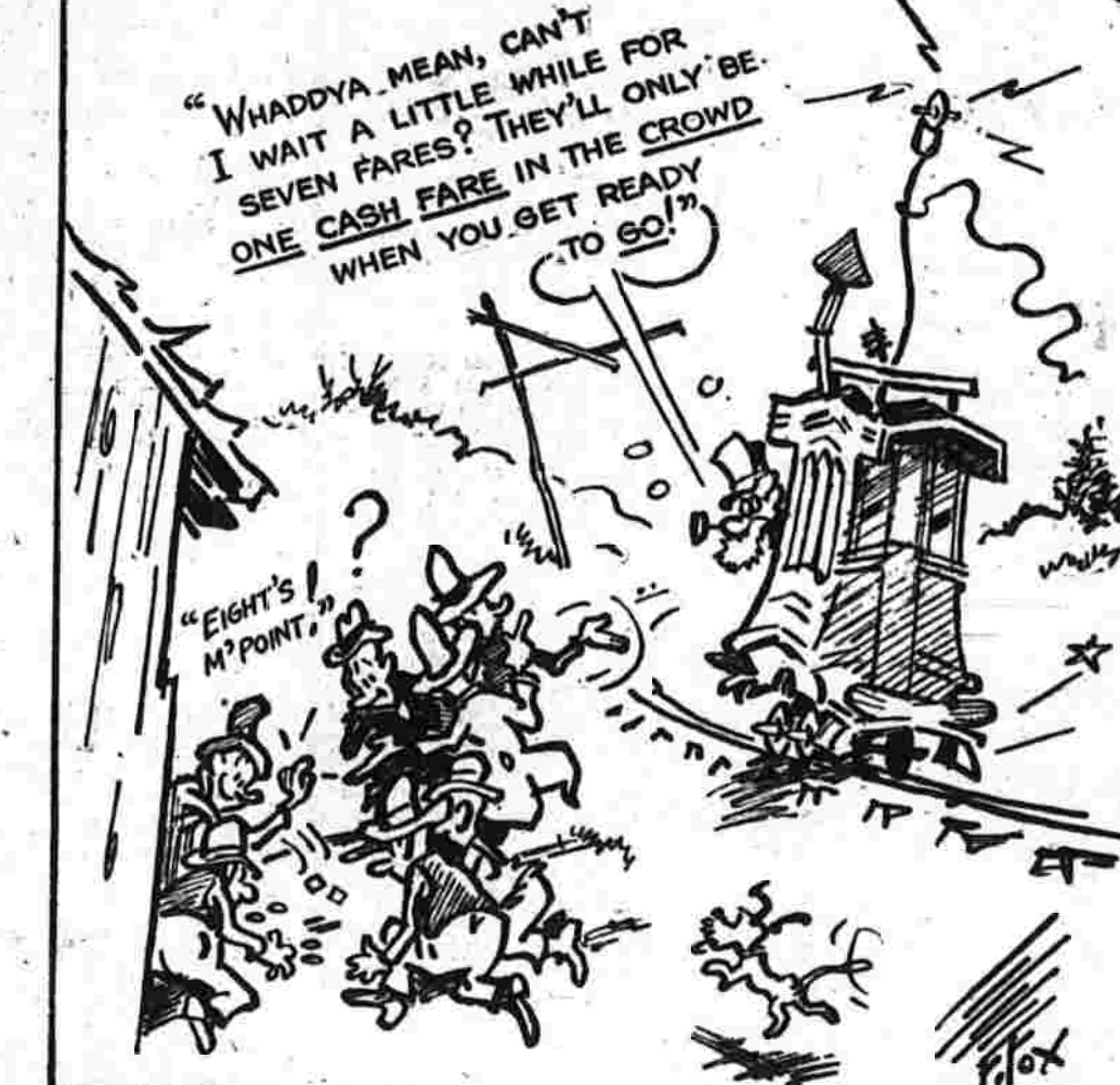
The Toonerville Trolley That Meets All the Trains